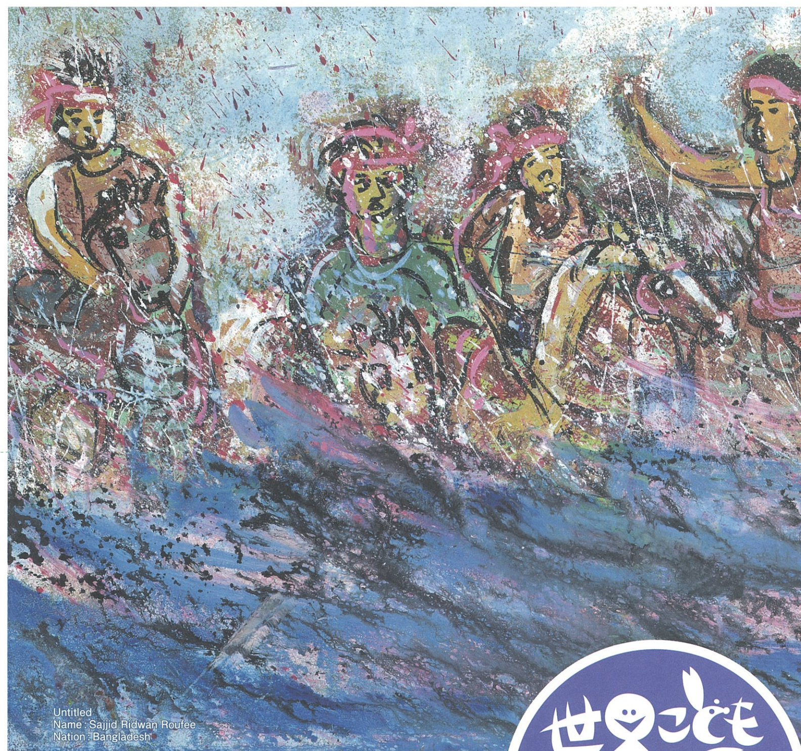
Untitled Name : Sajjid Ridwan Roufee Nation : Bangladesh

*Please Download from official website. https://www.ienuhikari-koubo.com/zugacon/english/ *This sheet can be copy.